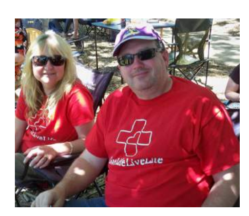
Modeling the T-Shirts!