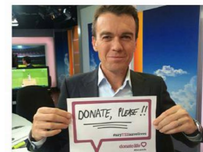
8:30 am · 03 Aug 15 from Melbourne, Victoria