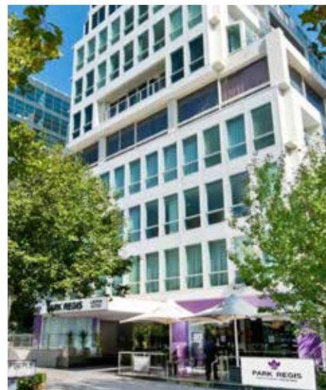
Park Regis Apartments – the HLTTV's SCAP accommodation partner

With our total financial support running to over $70,000 each year, HLTTV volunteers and our generous supporters have worked hard to ensure financial assistance is available for transplant recipients and their families, particularly rural, regional and interstate families receiving their second chance at life through heart or lung transplantation.