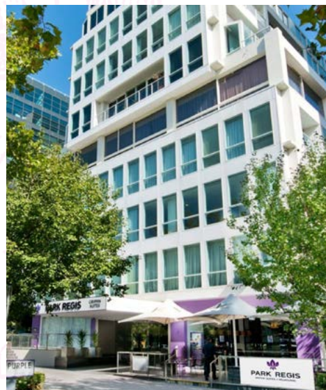
Park Regis Apartments – the HLTTV's SCAP accommodation partner

With our total financial support running to over $70,000 each year, HLTTV volunteers and our generous supporters have worked hard to ensure financial assistance is available for transplant recipients and their families, particularly rural, regional and interstate families receiving their second chance at life through heart or lung transplantation.