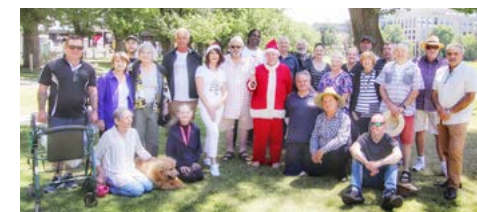
Our annual 'recipient' group photo of those attending the 2019 BBQ