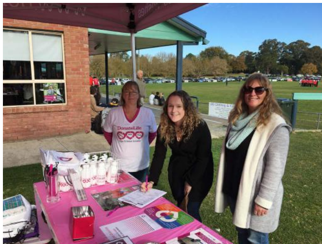
Supporters signing up as organ donors