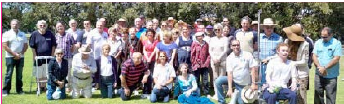
Pre & Post transplant recipients at the BBQ's

Christmas and Easter BBQs were held at Fawkner Park, opposite the Alfred and were well attended by members and their families (145 and 55 attendees respectively). The Committee also held a lunch on 14 October which 20 patients and families attended.