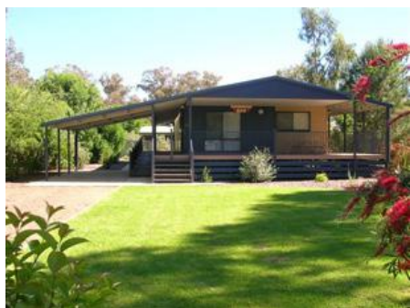
Peace and tranquility in Barmah.

A Committee was formed for the project and there was wonderful support from businesses, organisations and individuals.