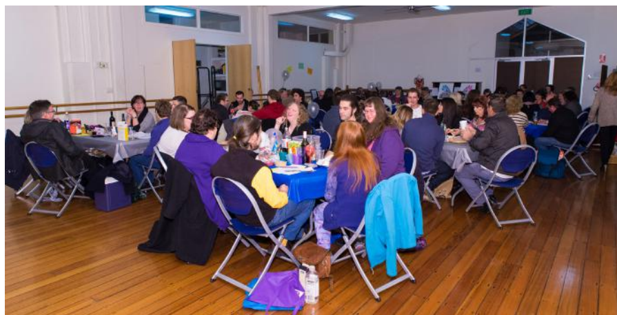
A very full house for the HLTTV Trivia Night fundraiser