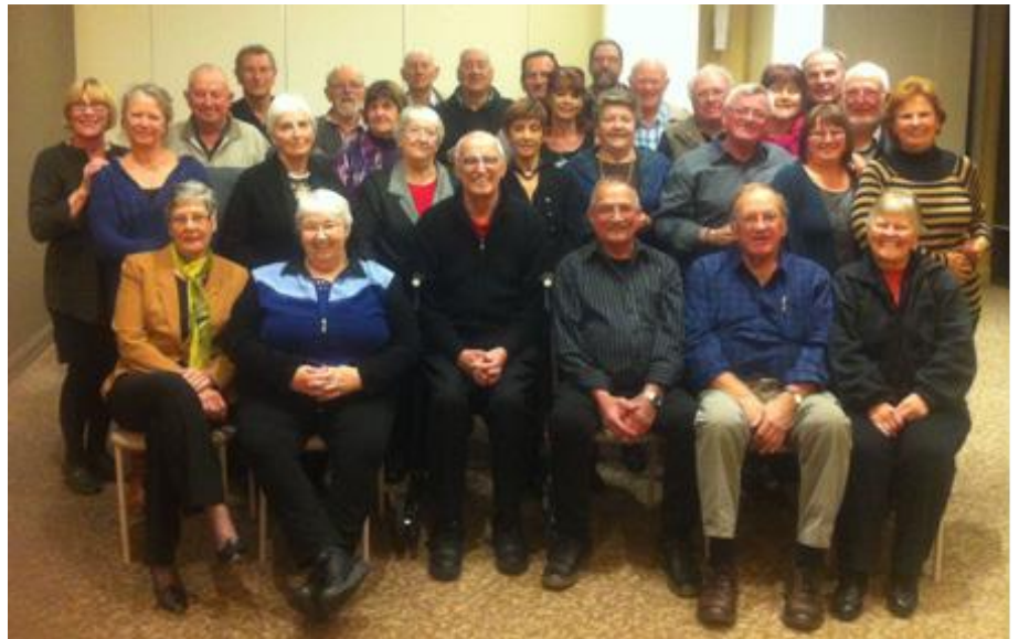
A celebration and thank-you dinner was held in July 2013 in conjunction with the AGM and handing over to the Rotary Club of Nathalia.

I know that it could not be in better hands.'