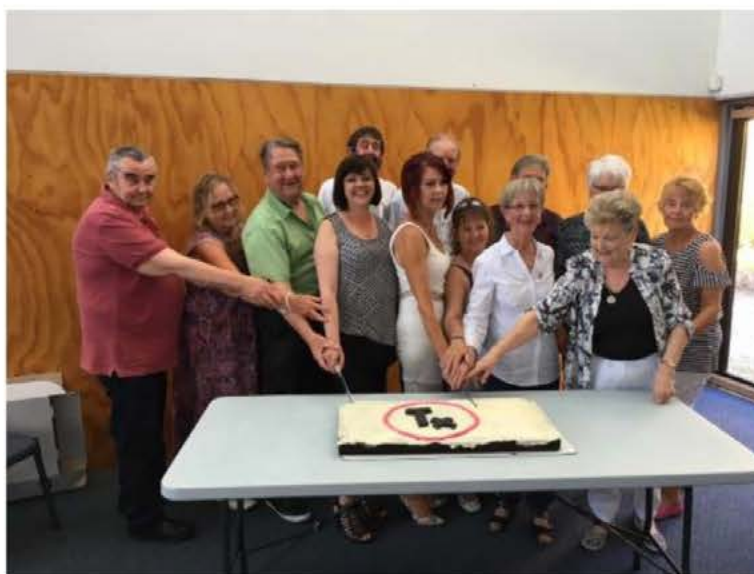
Cutting of recipients' cake.

rent life and the work of the HeartLung Transplant Trust.