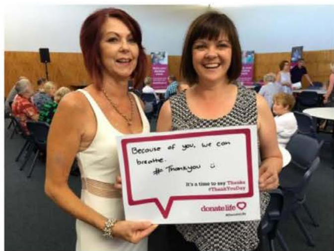
Recipients say 'Thank you'