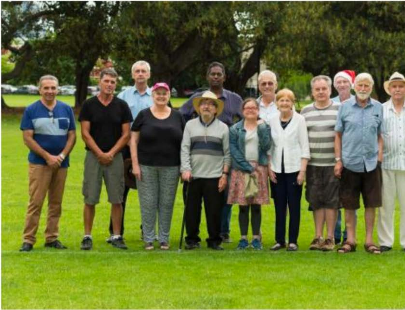
Heart Transplant Recipients