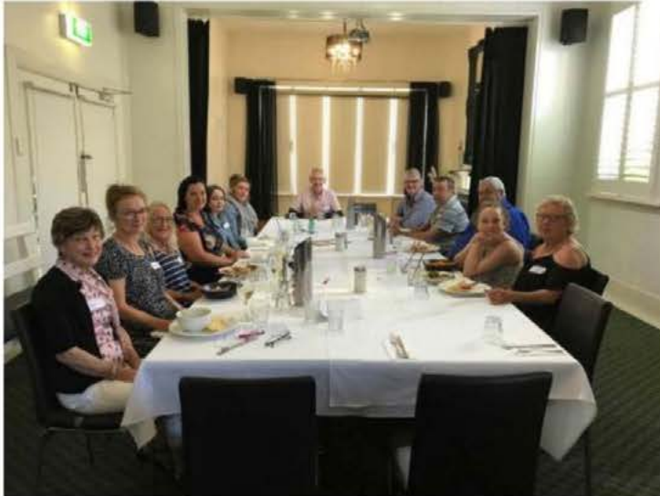
Ballarat transplant group lunch